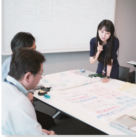
Vision Meeting Katsudo