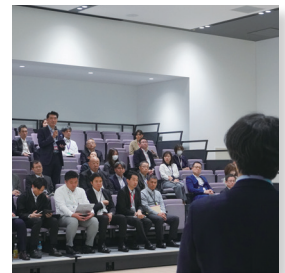
Wakuwaku Kifu Katsudo